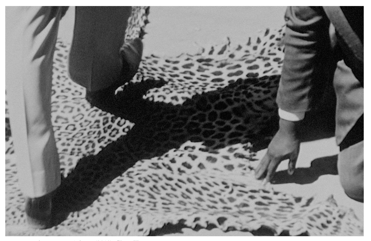
Jelena Jureša, Aphasia (2019), film still